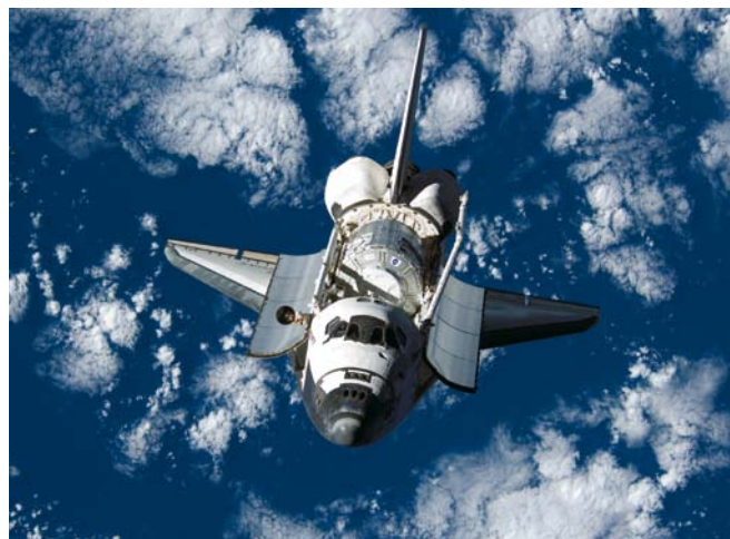
Space Shuttle Discovery

tems and more than 30 laboratories in Moscow, Leningrad, Obninsk, Sverdlovsk, Chelyabinsk, Omsk and Novosibirsk take part in so called “supersensitive arms race” made American Congress worry and allowed to provide new investments into research work. In the further budget projects a share for this purpose was increased up to USD 450 million per annum.